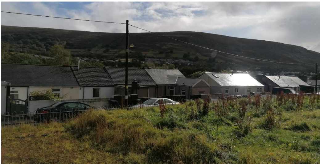
Fig 4. Views from within the site showing rear of properties along Railway Terrace.

5.15 Similarly, in terms of the dwellings to the rear of the site (Mount Pleasant), these dwellings are located in excess of 20m from the rear elevation of the proposed new properties and are at a higher level. As such, I am satisfied that there will not be unacceptable levels of overlooking between the existing and proposed dwellings.