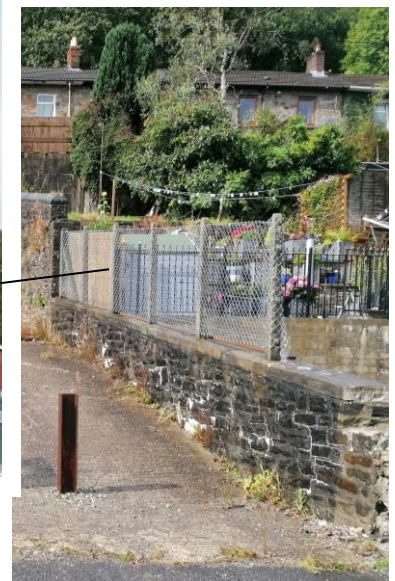
Fig 6 (Right): Existing boundary treatments to northern boundary.