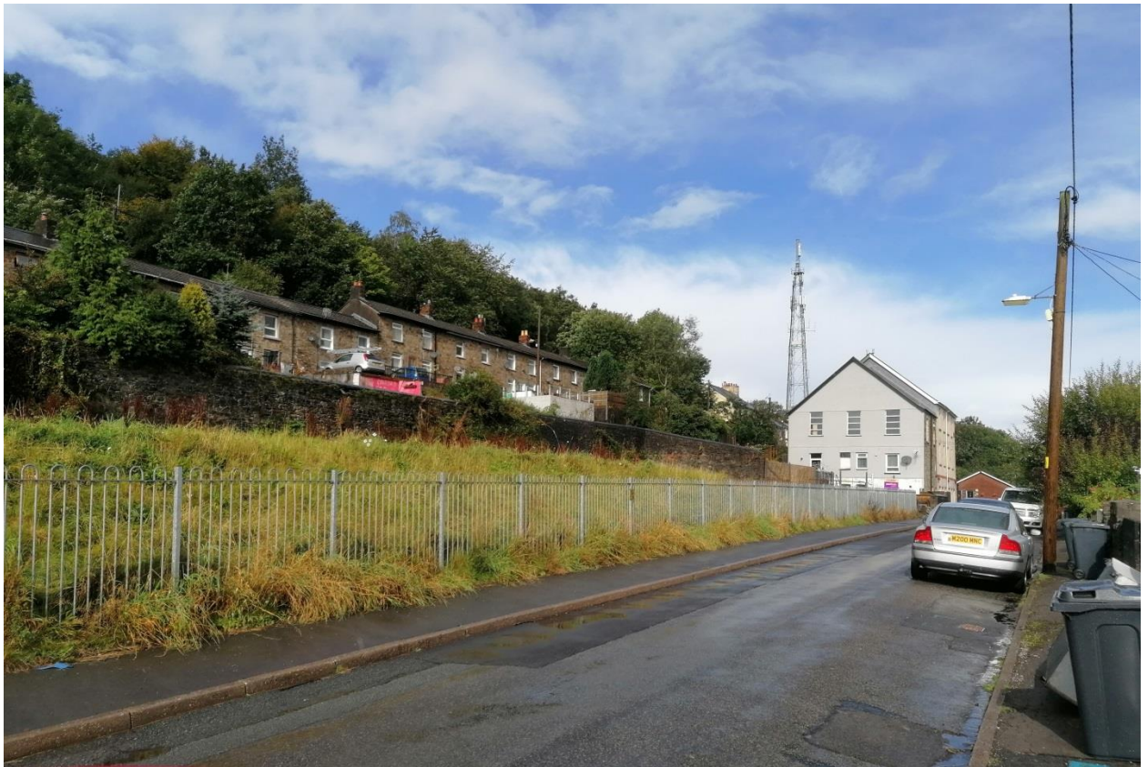
Fig 1. View of the site looking northwards