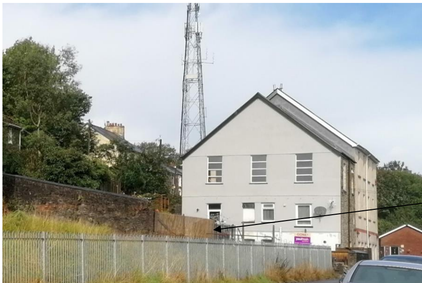
Fig 5 (above): 1 & 2 Ebenezer Cottages at northern end of site. Please note top row of windows are non-residential.