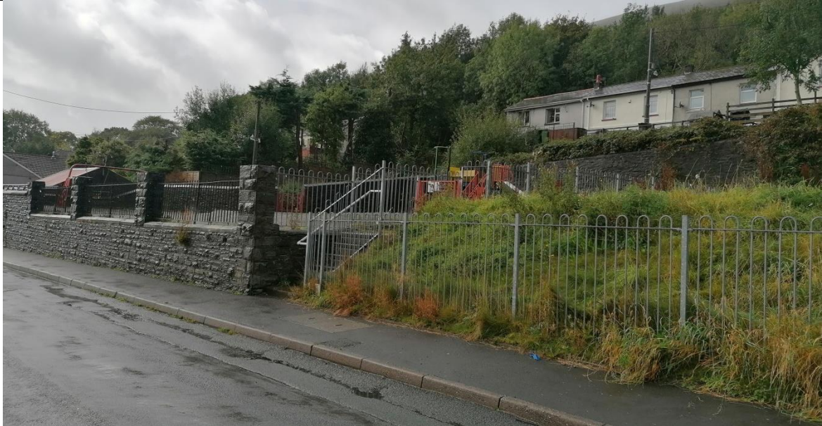
Fig 2. Southern end of the site (within galvanised railings) and adjacent playground (stone boundary)